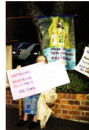
The MOWatch demonstration at General Synod in Brisbane in 2001.